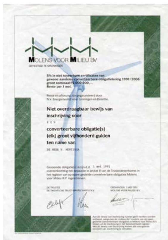
Bond of the company "Molens voor Milieu B.V." (Mills for the Environment), issued in Groningen in 1991, depicting a modern wind mill.

I found no scripophily from classic Dutch wind mill companies, although classic wind mills are depicted on several Dutch bonds and shares. But I am the proud owner of a rarely seen bond of the company "Molens voor Milieu B.V." (Mills for the Environment), issued in Groningen in 1991, depicting a modern wind mill. The loan was guaranteed by the electricity company of the provinces of Groningen and Drenthe. I find the name of the company, "Mills for the Environment", rather cynical, however, in view of the "horizon pollution" these mills cause throughout our beloved countryside. This is the only stock with a modern wind mill depicted that I know of. Who knows of any other modern wind mill scripophily?